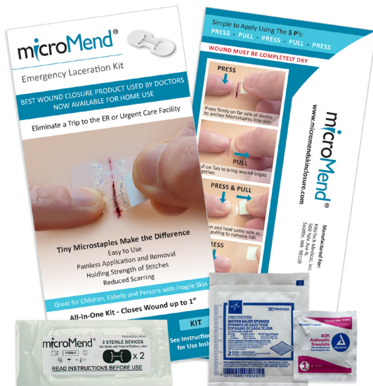
microMend Bestselling Product Emergency Laceration Kit

microMend is available in several convenient options including an Emergency Laceration All-In-One Kit with everything needed to close a single wound; an Emergency Laceration Closures Multi-Pack with six microMend devices for multiple wound closures; and an Emergency Laceration Closures Combo-Pack that contains the two most popular sizes, microMend Extra Small (XS) and microMend Small (SM).